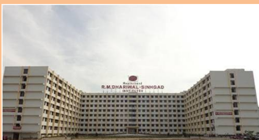
RMD Sinhgad School of Management Studies Campus, Warje, Pune